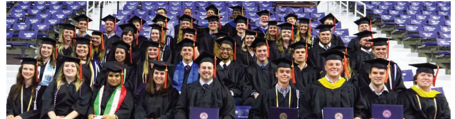
IMSE SPRING 2018 GRADUATES