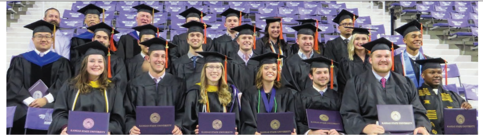
IMSE FALL 2018 GRADUATES